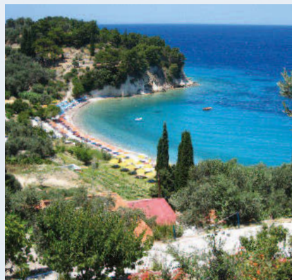
Tsamadou beach near Kokkari

But the greatest appeal of this area is for walkers and country-lovers. The village is at the foot of lush Nightingale Valley ('Aidonia'), one of the most beautiful areas of Samos. A walk up the steep, thickly-forested valley to the pretty village of Manolates, with its welcoming tavernas and panoramic views, is a must, and serious walkers can go on from here.