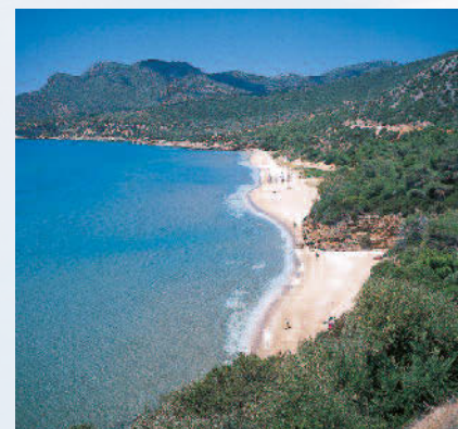
South West Samos near Votsalakia