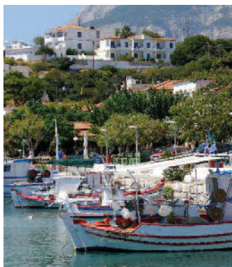
Location of Pavlis Studios

Air Conditioning: available if required at a local charge of €6 per day.