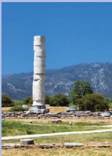
Temple of Hera

Finally Samos is known for its wine (the Golden Samena in particular is excellent). Perhaps that's why the temple remains still unfinished!