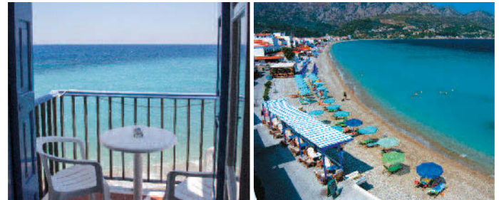
Kokkari main beach as viewed from Lemos Hotel