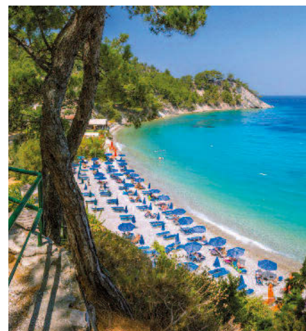
Lemonakia Beach below Villa Penny

Due to the location, this property would not be suitable to anyone with walking difficulties without a car. Popular white-pebble Lemonakia Beach, quickly reached in under 5 minutes via a short cut down the hill, has two good tavernas. Of course a much wider choice can be found in Kokkari a 15 minute walk away but bring a torch for late night returns. Or, a taxi from Kokkari will take you for only a few euros.